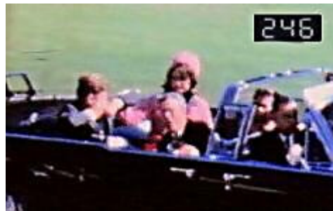
Figure 2 The assassination of President John F. Kennedy