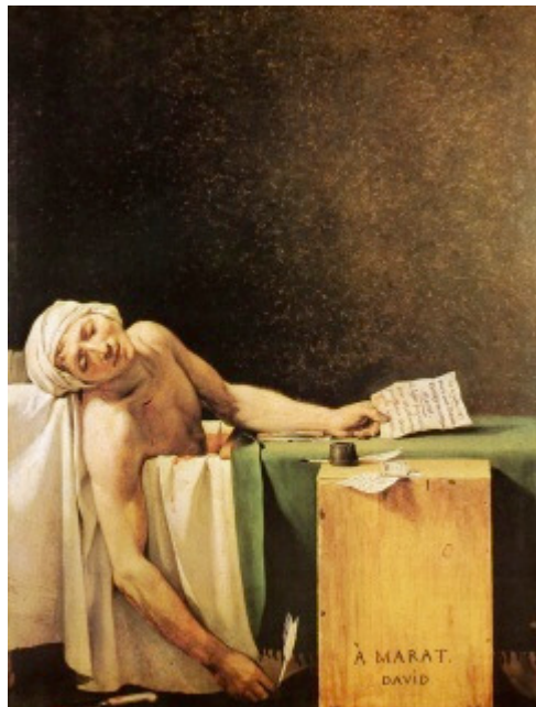
Figure 1 Jacques-Louis David (1748-1825): The murdered Marat

who had been imposed by a foreign power. Famous paintings depict the murder of rulers such as David's "The murdered Marat"(Figure 1).